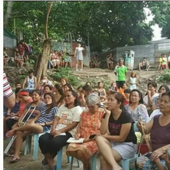
Aspire Homes is a socialized and economic